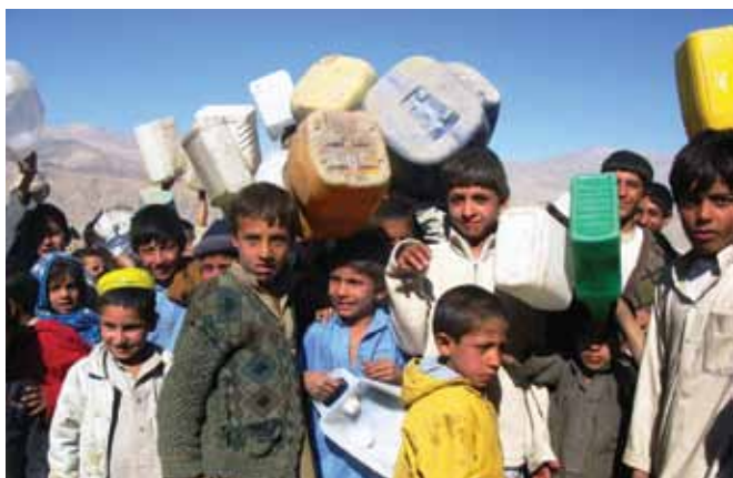
Displaced children in Afghanistan.