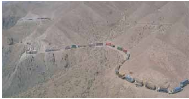
A fuel supply convoy makes its way through the mountains of Afghanistan.

While new technologies and “greening” the Pentagon should be part of the solution in the short-term, a better long-term approach would be to reduce U.S. military engagement worldwide and invest in stronger