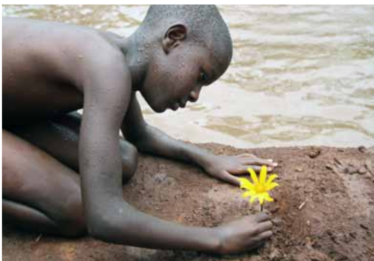
A Kenyan boy plants a flower after swimming in puddles left by rain in the Mathare slum.

Global warming poses enormous risks to U.S. national and global security. Issues as disparate as genocide prevention, sustainable energy policy, migration, food security, and extreme weather are all significant to this discussion. Equally important to remember, though, is that these issues can be positively addressed. The environments where communities reside are absolutely critical to livelihoods and human security. The interdependent relationship between people and the land calls for protecting the environment and working for peace. If taken together, these activities may unite historically contentious neighbors for powerful and effective action to address the threat of global warming. We might call this combined effort “environmental peacebuilding.”