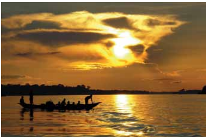
Traditional wooden boat floats on the Congo River in the Democratic Republic of Congo. A rare moment of peace in a country torn by war.