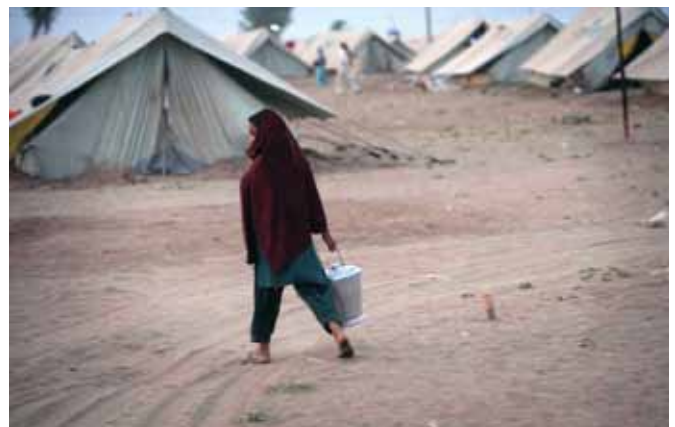
Jalozai refugee camp, Pakistan.

Heightened food insecurity caused by the effects of global warming may be another source of increasing competition, desperation, and potential conflict. The climate change, adaptation and conflict report commissioned by USAID states, "human insecurity is the necessary link between climate change and conflict. When human security is threatened, and especially when governance is weak or lacks legitimacy, there is