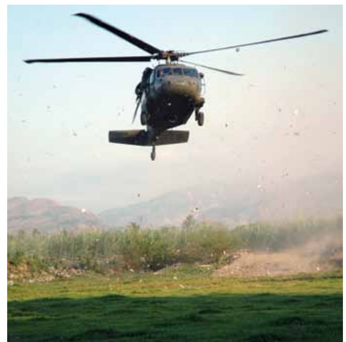
Rescue helicopter.

Moreover, access to cheap fossil fuels drives U.S. foreign policy, entangling the country in a complex web of