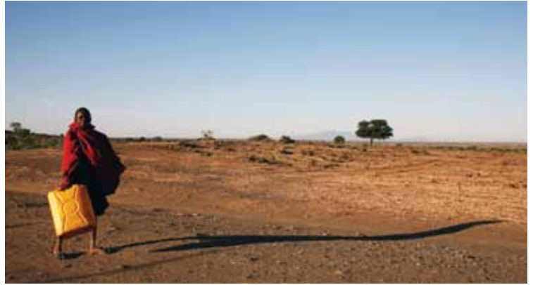
Ugandan girl searches for water. Increased population and a drier climate put pressure on resources.

The United States has both a moral responsibility and a national interest in planning for the effects of global warming, working urgently to reduce carbon emissions, and helping communities at home and abroad to mitigate and adapt to the negative effects of global warming. Through bold leadership toward a new clean energy future, the U.S. has an opportunity to help prevent violent conflict and forge a new era of environmental collaboration rather than resource competition among nations.