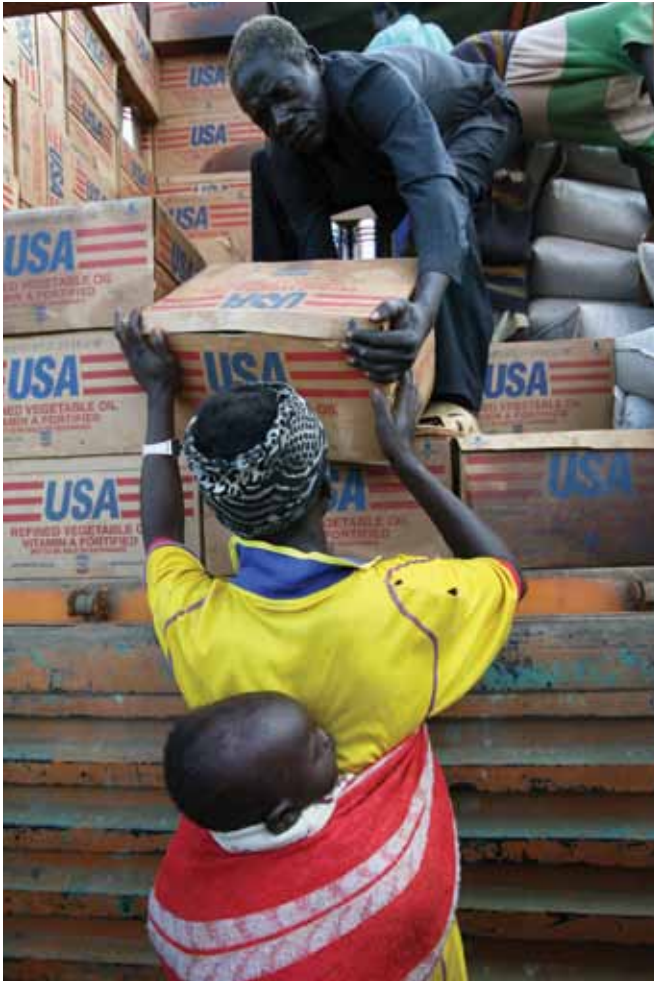
Woman at an internally displaced person's camp picks up her food ration.