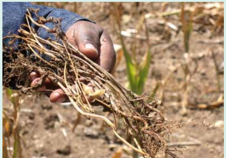
Withered bean plant. Farmers in Kenya and elsewhere experience more failed crops.

and directed specifically toward sustainable development projects that would help meet both individual and community needs. In turn, migration itself could be reduced as communities become more able to withstand the effects of global warming and maintain viable economies. Remittances should in no way supplant the responsibility of developed countries to provide funding for international adaptation. They could, however, provide an additional resource to support communities and reduce widespread migration.